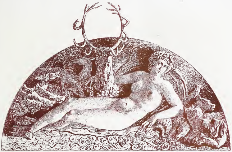
THE NYMPH OF FONTAINEBLEAU.